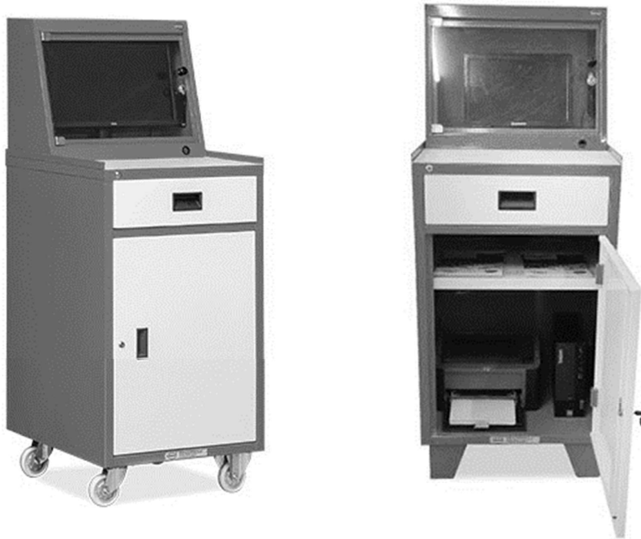
Fig.: Approximate Image/Layout of the Locking Computer Storage Cabinet with Trolley/Wheels