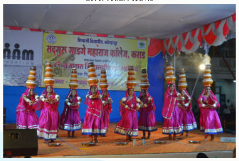
Students performing Folk Dance