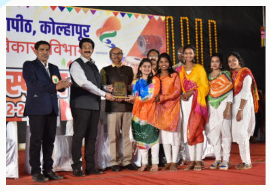
Prize Distribution Ceremony of Shivspandan