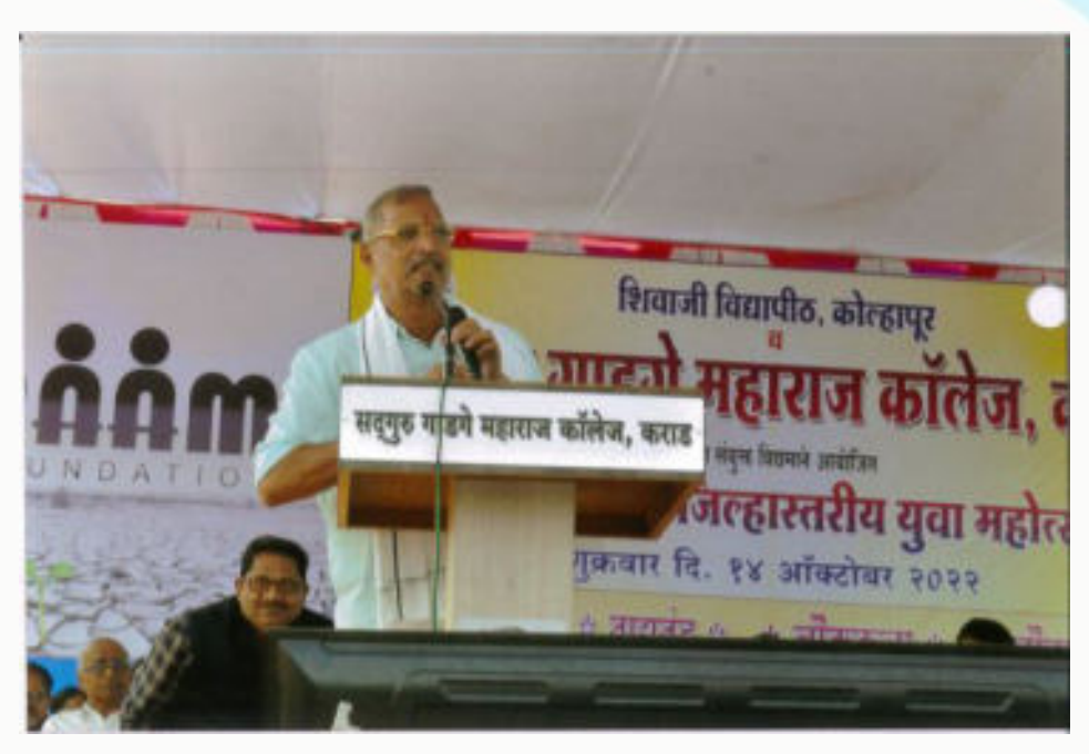
Inaugural speech by Hon'ble Nana Patekar at S.G.M College, Karad Satara Distict Level Youth Festival