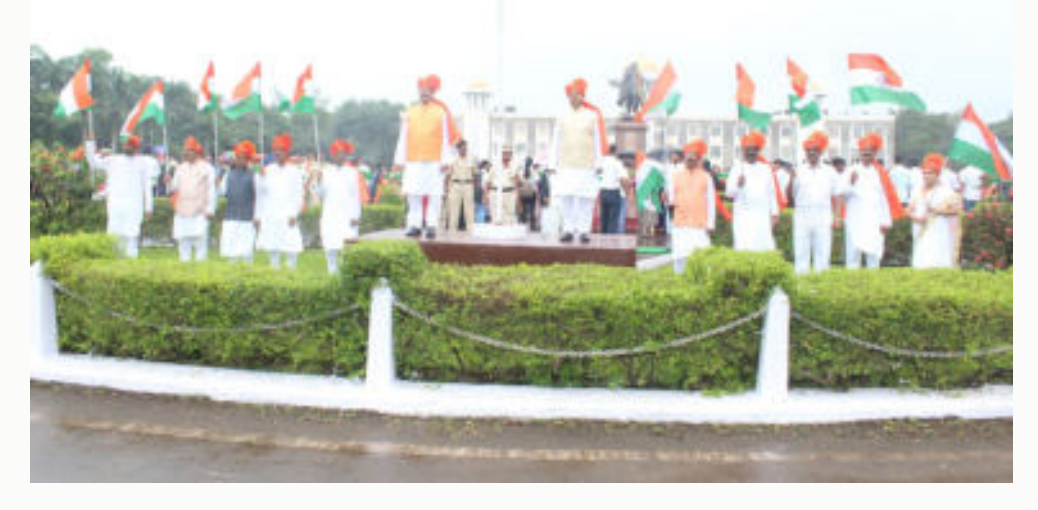
Glimpses of Flag Hosting on the occation of Azadi ka Amrut Mahostav