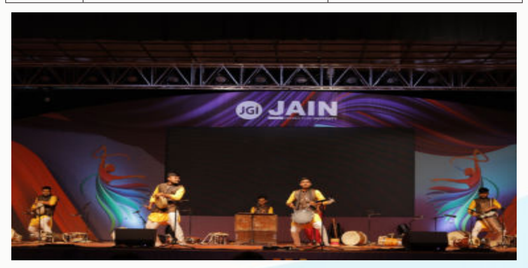
Folk Orchestra of National Youth Festival at Jain University, Bengaluru