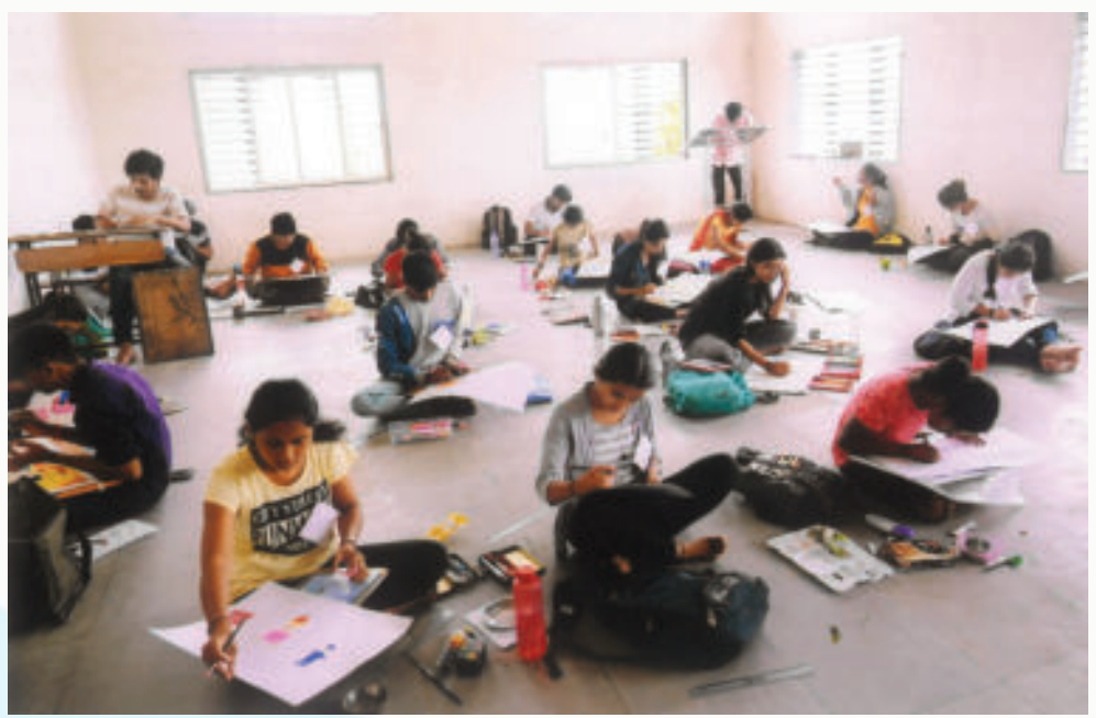
Poster Making in Central Youth Festival at Shrimant Babasaheb Deshmukh Mahavidyalaya, Atpadi