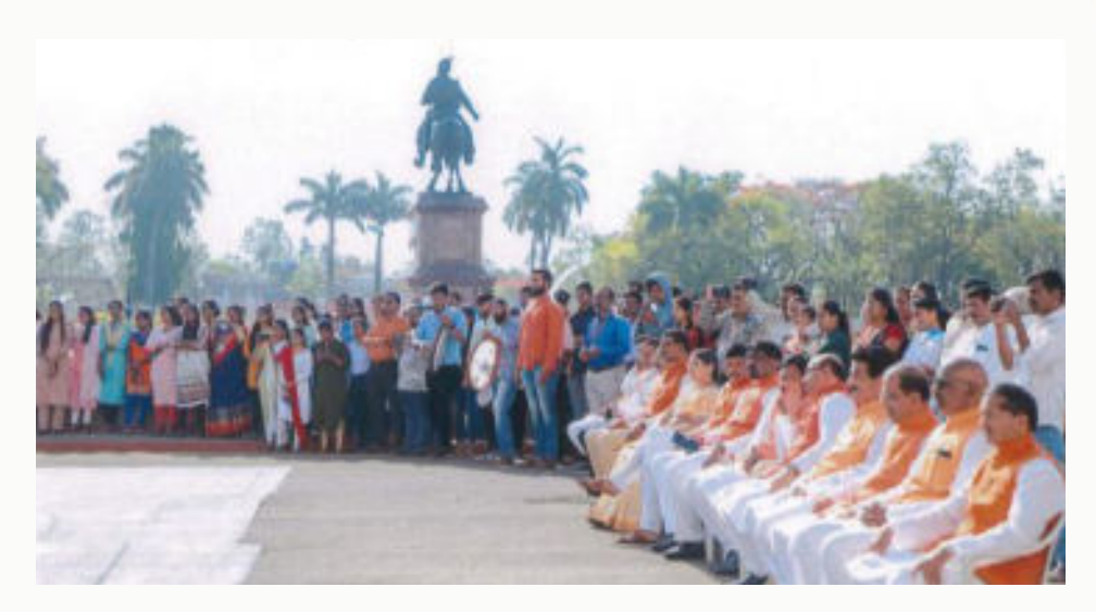
Glimpses of Maharashtra Din