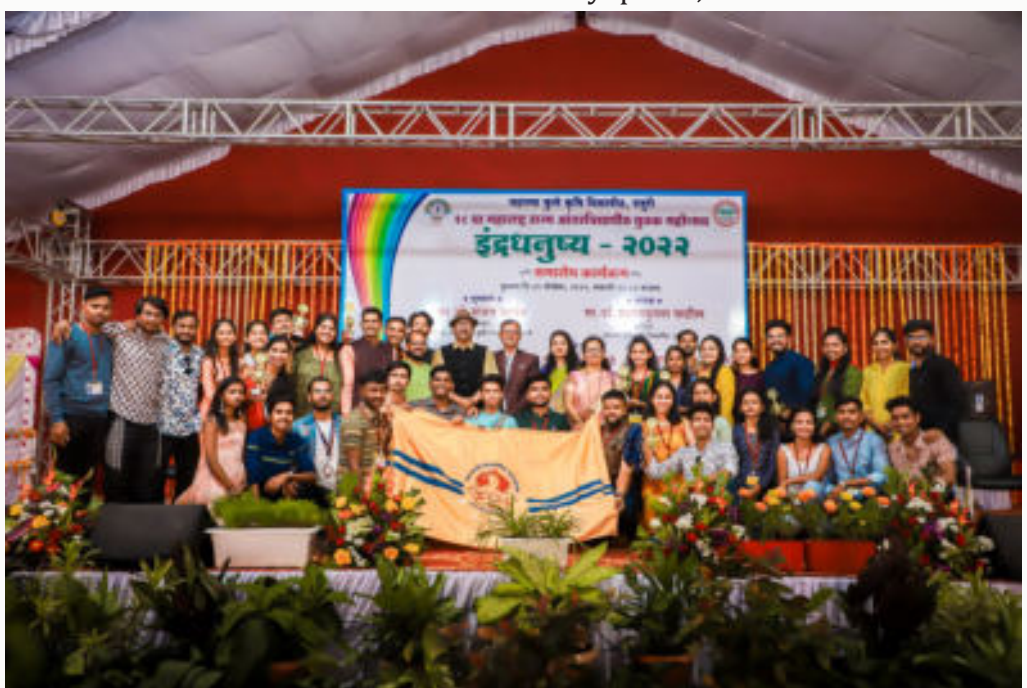
Team of Indradhanushya Youth Festival - Shivaji University, Kolhapur