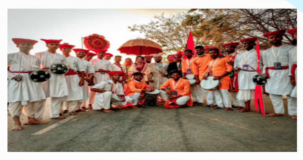
Procession Rally of National Youth Festival at Jain University, Bengaluru