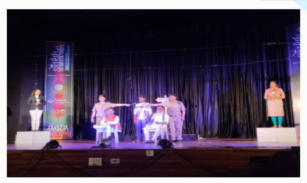
Presentation of One Act Play by team of Shivaji University, Kolhapur