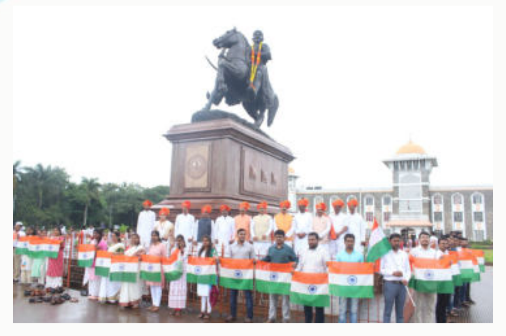
Glimpses of Flag Hosting on the occation of Azadi ka Amrut Mahostav