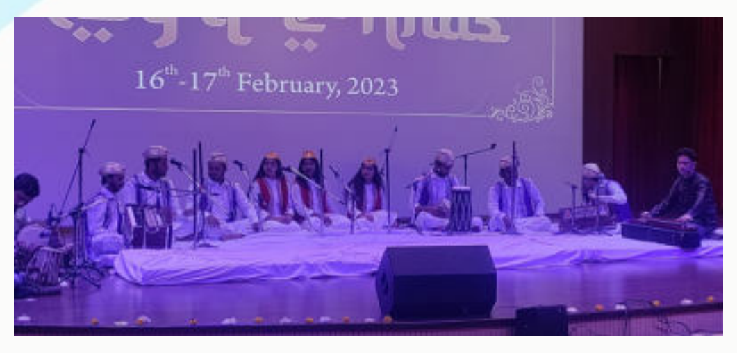
Qawwali Presentation of Team Shivaji University, Kolhapur at Noida University, Noida (Uttar Pradesh)