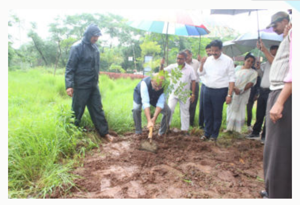
Plantation on the occasion of Kranti Din