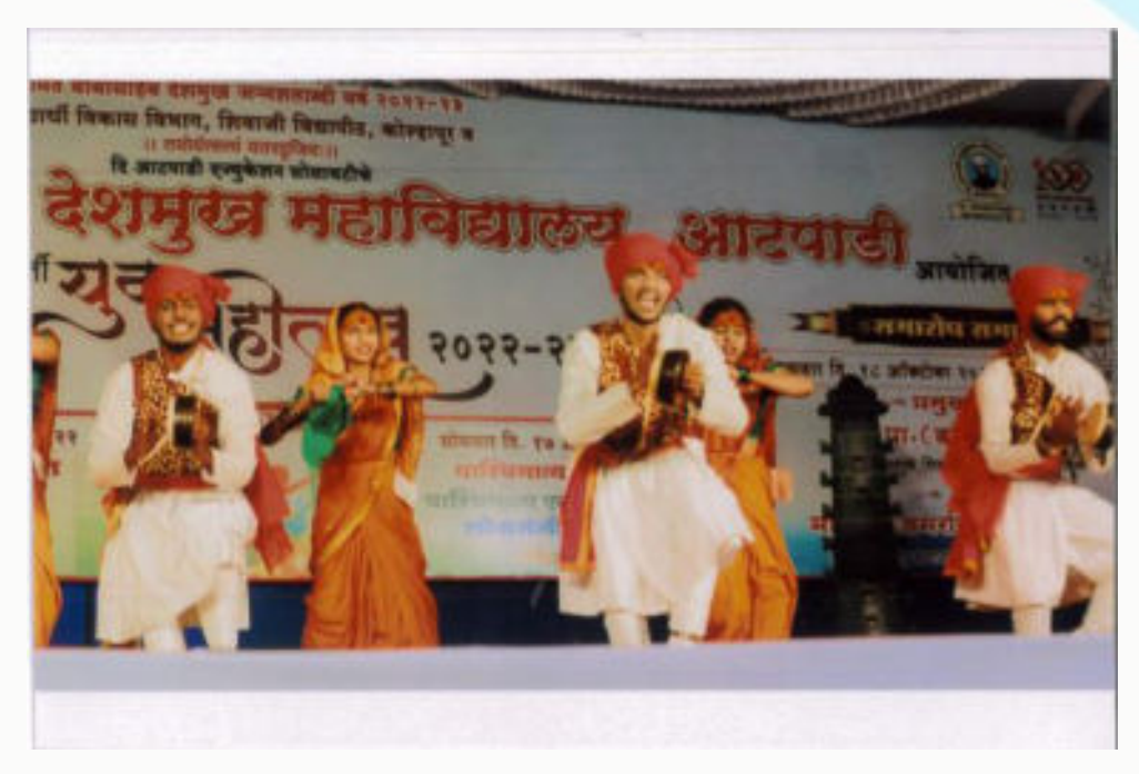
Folk Dance Performance