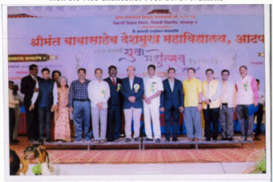
Central Youth Festival Prize Distribution Ceremony