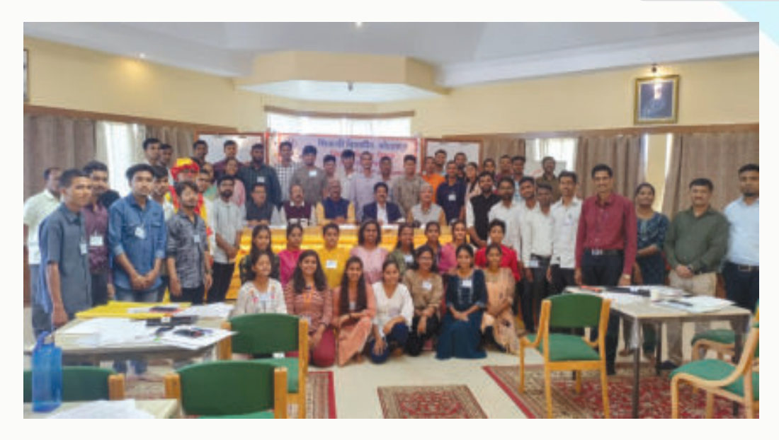
Participants of Leadership Development Camp at Baha'I Academy, Panchgani.