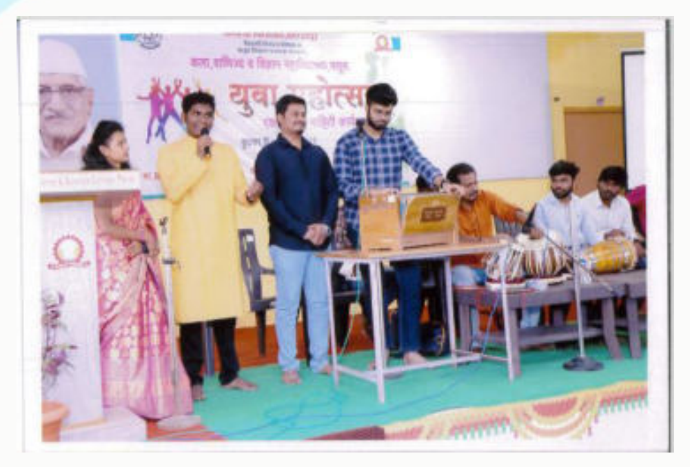
Guidance by the Experts at Sangli District Level Youth Festival Workshop