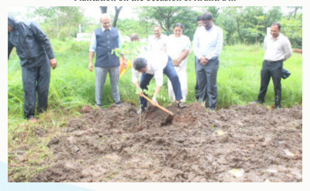
Plantation on the occasion of Kranti Din