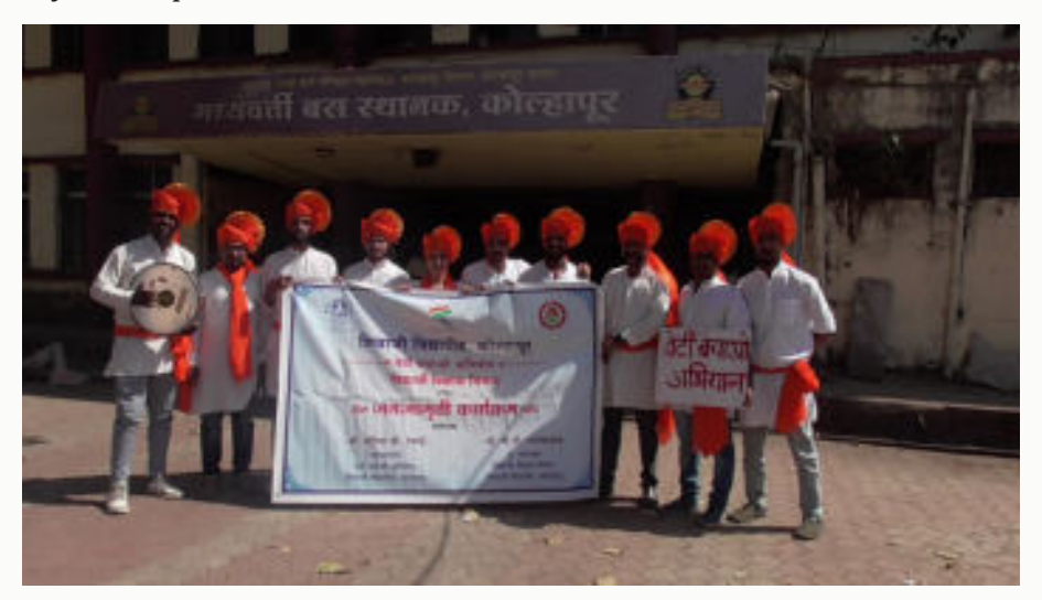
Students performing Street Play

A Street Play Awareness Programme was organized by the Music and Dramatics department of Shivaji University, Kolhapur. The programme aimed to raise awareness about the declining child sex ratio. The street play was performed in various important locations of Kolhapur city and on the campus of Shivaji University, Kolhapur.