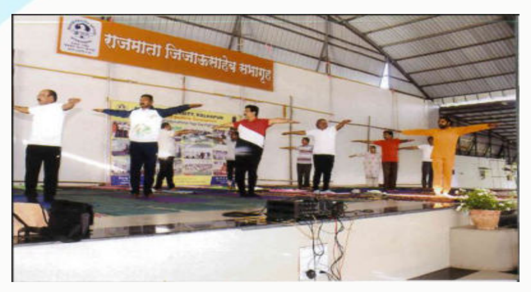
Celebration of Internationa yoga Day by the officer of Shivaji University