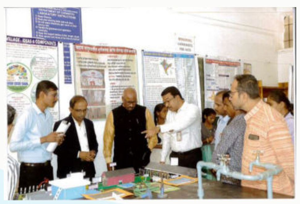
Satara District Level Avishkar Compitition