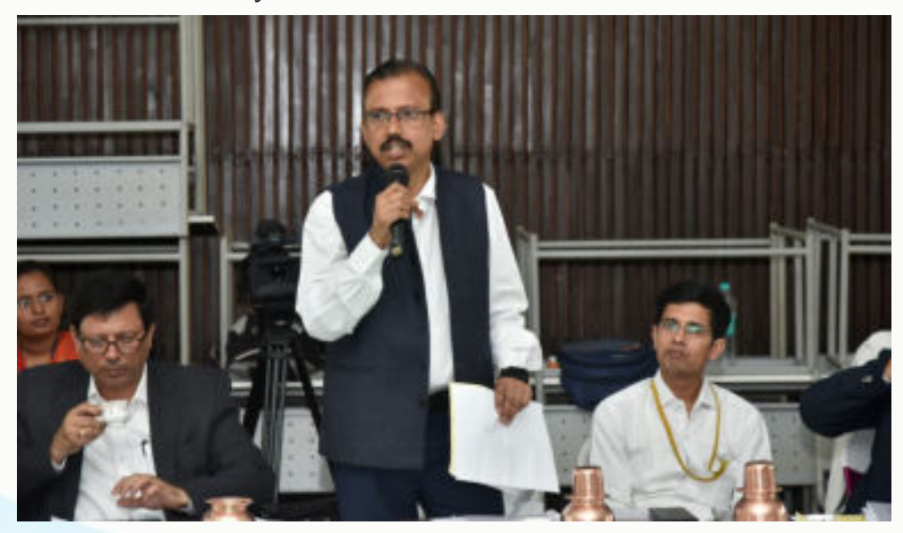
Guidance by Expert of Ministry of Parliament Affairs