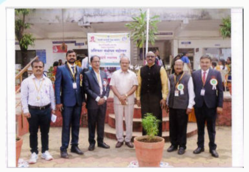
Kolhapur District Level Avishkar Compitition