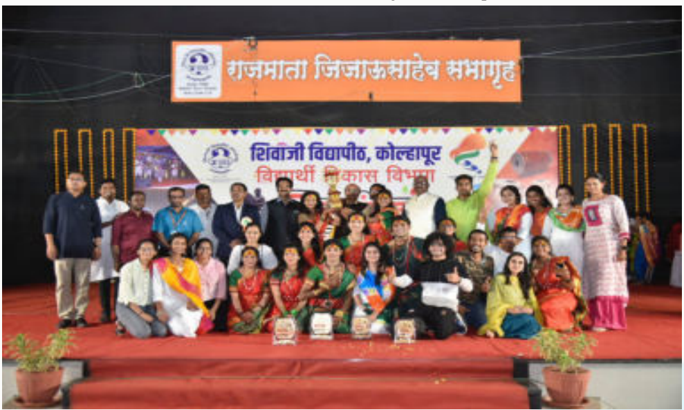
Prize Distribution of General Championship Trophy Win by Department of Music and Dramatics, Shivaji University, Kolhapur