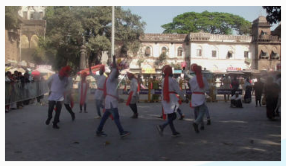
Students performing Street Play