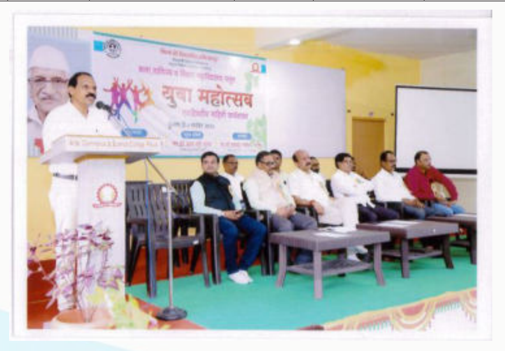
Inaugural Function of the Sangali district Youth Festival Workshop (Arts, Commerce and Science College, Palus)