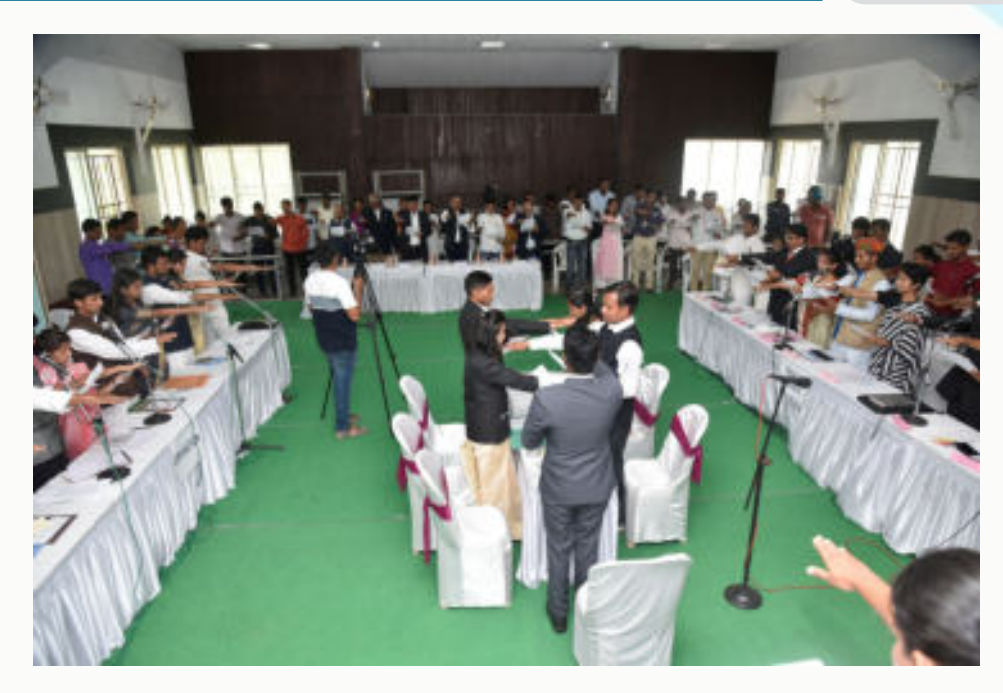
Oth by National Youth Parliament Members