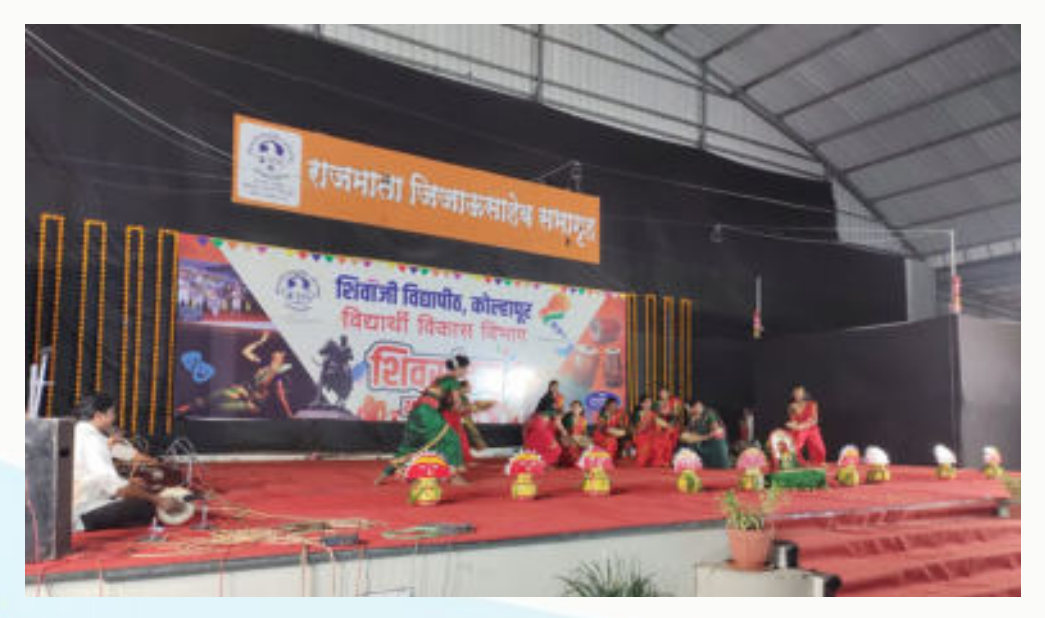
Group Dance in Shivspandan