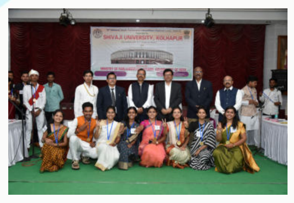
Winners of National Youth Parliament Selected for National Parliament to be held at Delhi