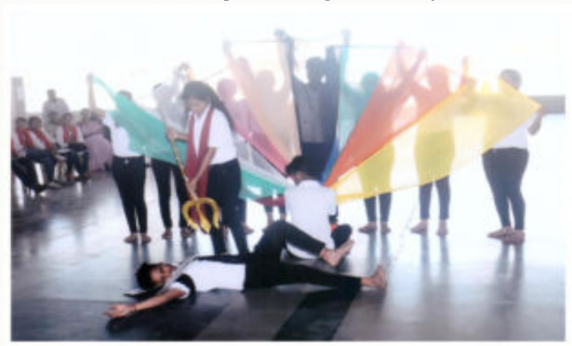
Students performing Street Play