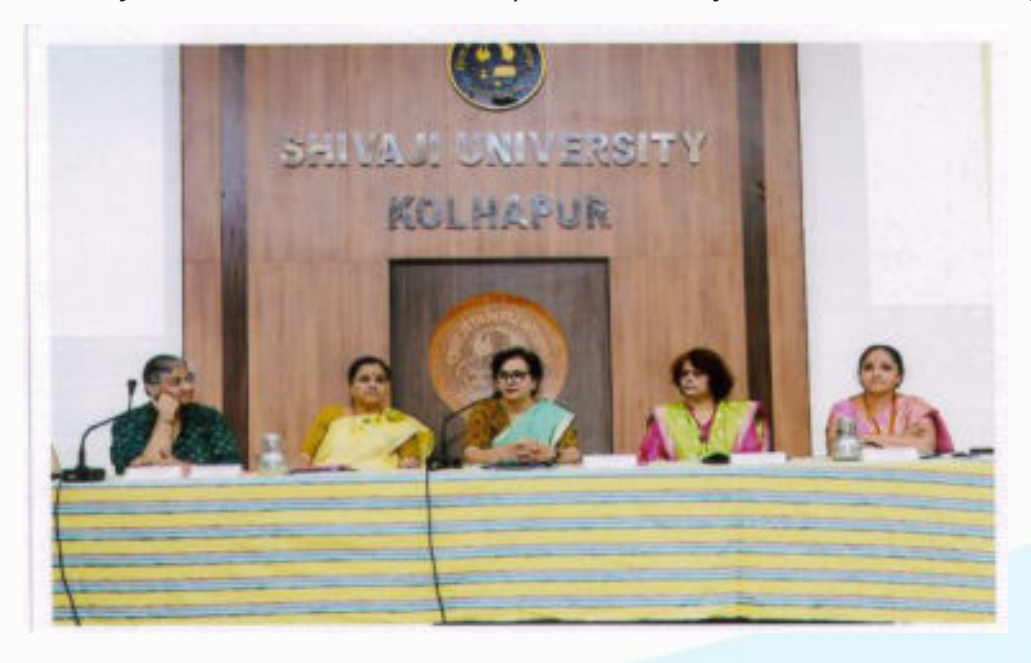
Guidance by Experts in International Women's Day