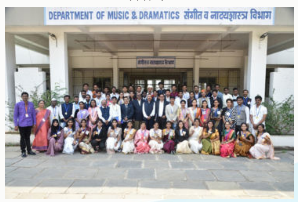
Team of Shivaji University, Kolhpur of National Youth Parliament