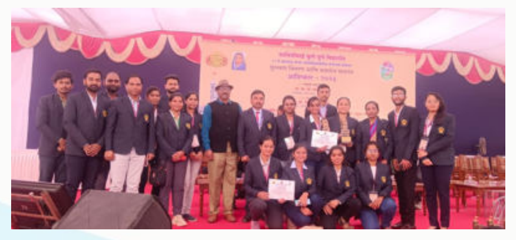
Team of Avishkar Research Competition Shivaji University, Kolhapur at Savitribai Phule Pune University, Pune