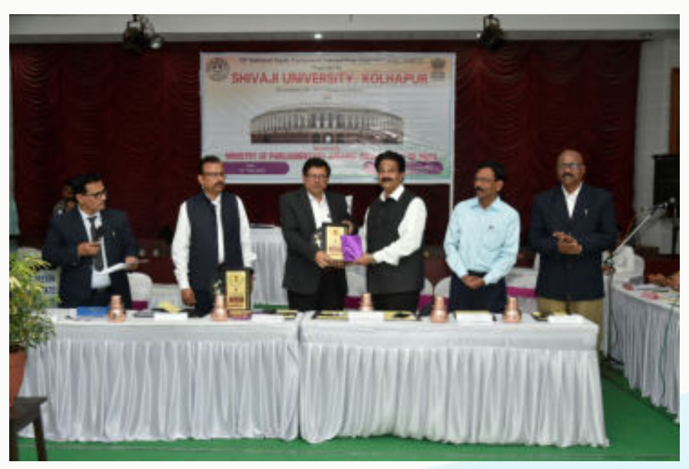
Felicitation of Experts from Ministry of Parliament Affairs in National Youth Parliament Competition