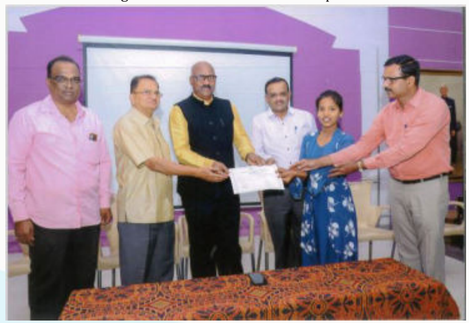
Prize Distrubution Ceremony Sangli District Level Avishkar Compitition