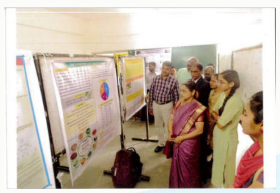
Kolhapur District Level Avishkar Compitition