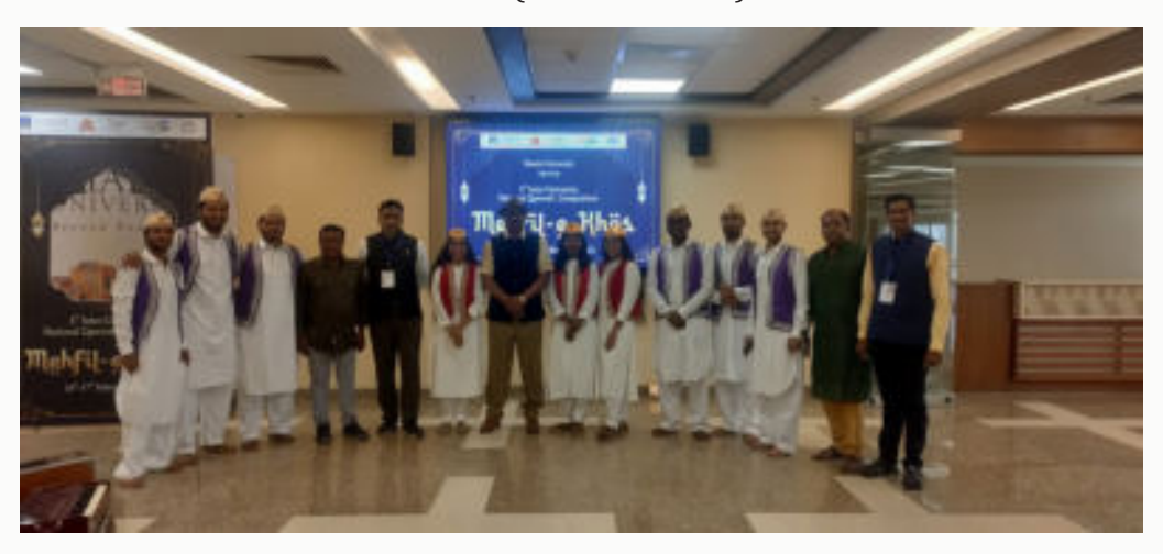
Team of National Qawwali Competition Shivaji University, Kolhapur in Noida University, Noida (Uttar Pradesh)