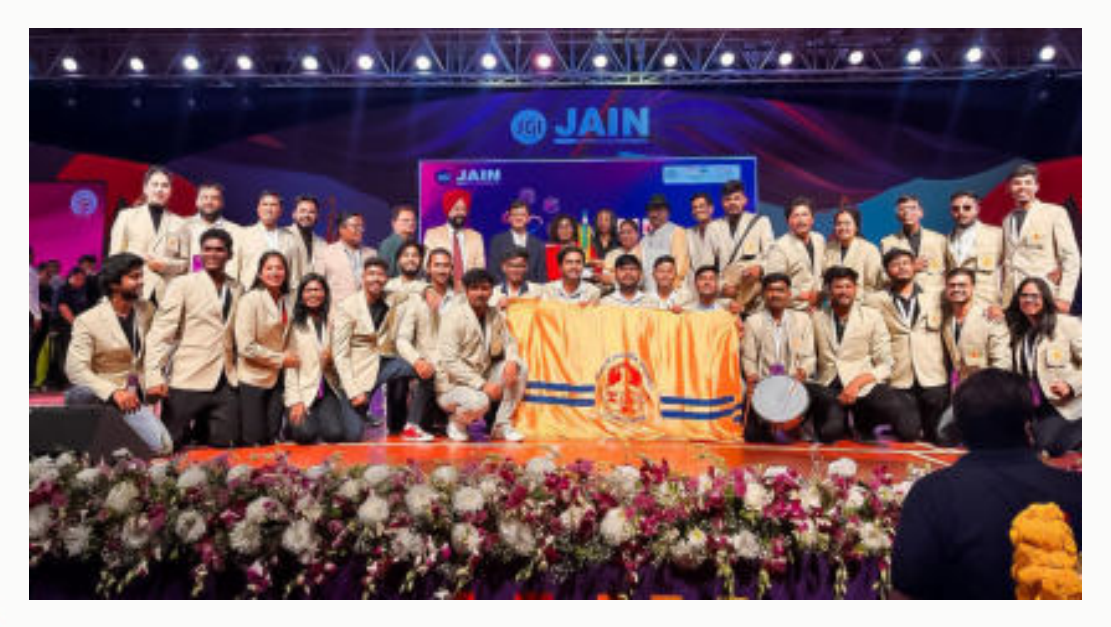
Prize Distribution Ceremony of National Youth Festival at Jain University, Bengaluru