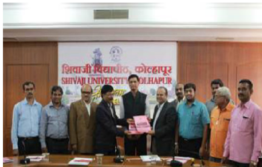
MoU with m Tutor Chennai

This MoU between Indo German Tool Room (IGTR), Aurangabad and Department of Technology carries special importance because of following area of mutual cooperation.