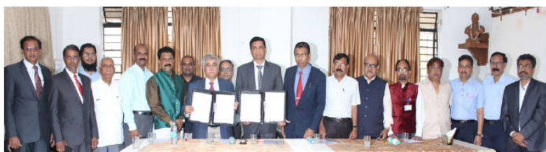
MoU signing ceremony between Shivaji University, Kolhapur and Dhatu Tantra Prabodhini

This MoU was signed to create a collaborative environment for developing,