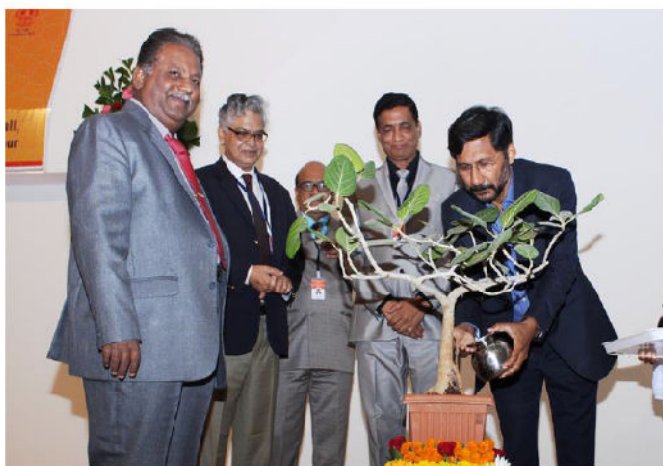
AIU Meet Inauguration Function

16. AIU West Zone Vice-Chancellor's meet