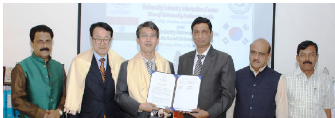
MoU signing ceremony between Shivaji University, Kolhapur and Chonnam National University

This MoU with South Korean Chonnam National University was signed to facilitate exchange