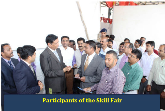
Participants of the Skill Fair