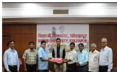
MoU with Vira Pumps, Kolhapur