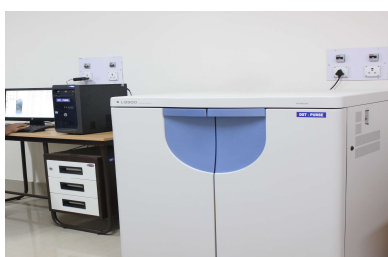
Amino Acid Analyzer