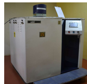
Gamma Chamber GC 5000