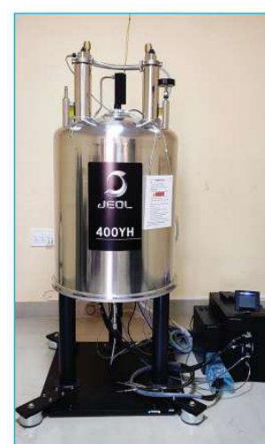
NMR SYSTEM Model/Make: Jeol, JNM-ECZ400S/L1, Japan