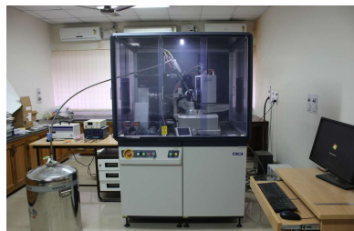
Single Crystal XRD