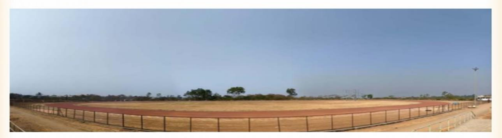
Athletics Synthetic Trackof International Level

Report of the Board of Sports & Physical Education 2023-24