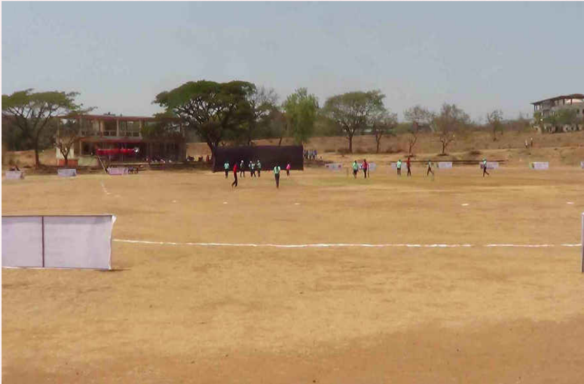
Cricket field with Pavilion