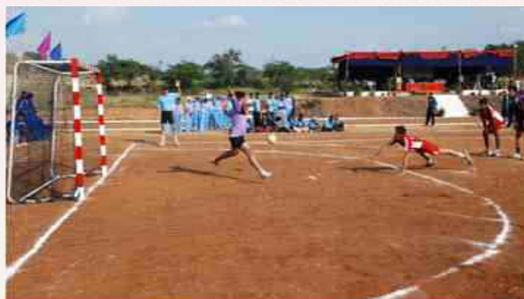
West Zone & Inter Zonal Inter Varsity Handball (M & W) Tournament 2008-09