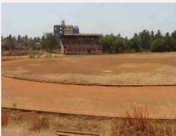
West Zone & Inter Zonal Inter Varsity Football (W) Tournament 2012-13