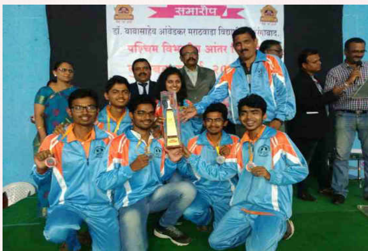
Victory Ceremony at Dr. Babasaheb Ambedkar Marathwada University, Aurangabad

University Chess (Men & Women) team secured IIInd place in West Zone Inter University Chess (Men & Women) Tournament 2015-16 held at Dr. Babasaheb Ambedkar Marathwada University, Aurangabad from 01st to 04th October, 2015 and qualified for All India Inter University Chess (Men & Women) Tournament 2015-16 held at Tilka Manjhi Bhagalpur University, Bhagalpur from 20th to 25th January, 2016.