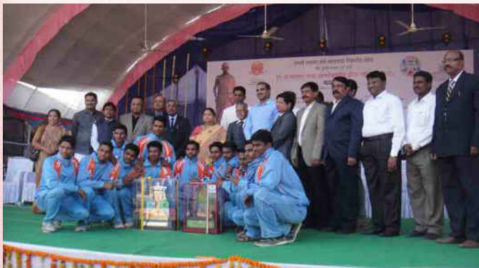
Krida Mahotsav – 2014 held at Nanded Kho-Kho Men Team – Runner's up