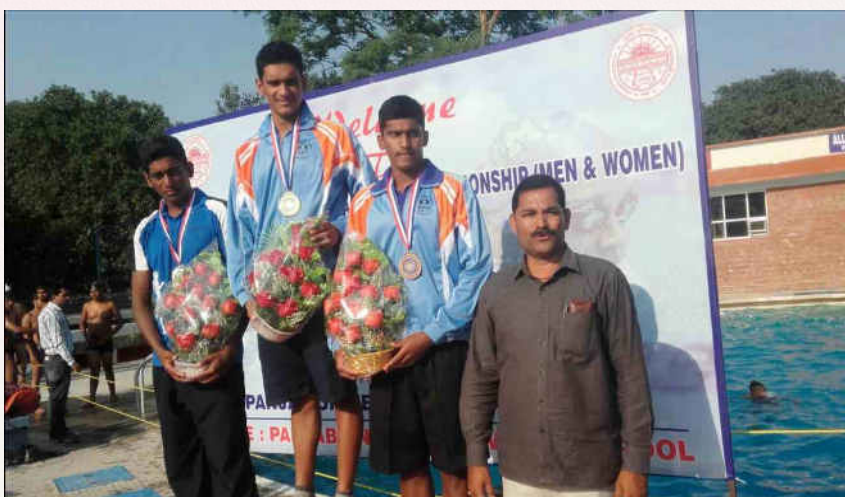
Photograph of one of the victory ceremonies of Inter Varsity Swimming competitions