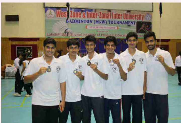
Victory Ceremony at L.N.I.P.E., Gwalior

University Badminton (Men) team secured IIIrd place in West Zone Inter University Badminton (Men) Tournament 2015-16 held at L.N.I.P.E., Gwalior from 12th to 15th October, 2015 and qualified for All India Inter University Badminton (Men) Tournament 2015-16 held at the same venue from 17th to 19th October, 2015.