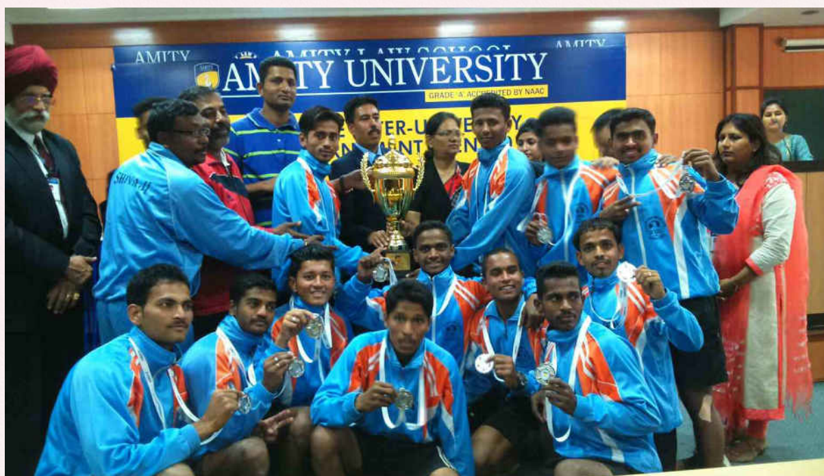
Victory Ceremony at Amity University, Noida