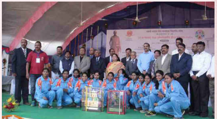
Krida Mahotsav – 2014 held at Nanded Volleyball Women Team – Runner's up