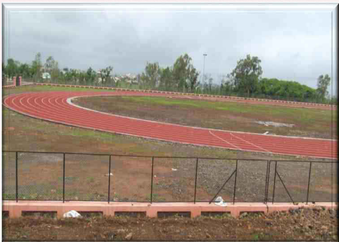
Athletics Synthetic Track of International Level