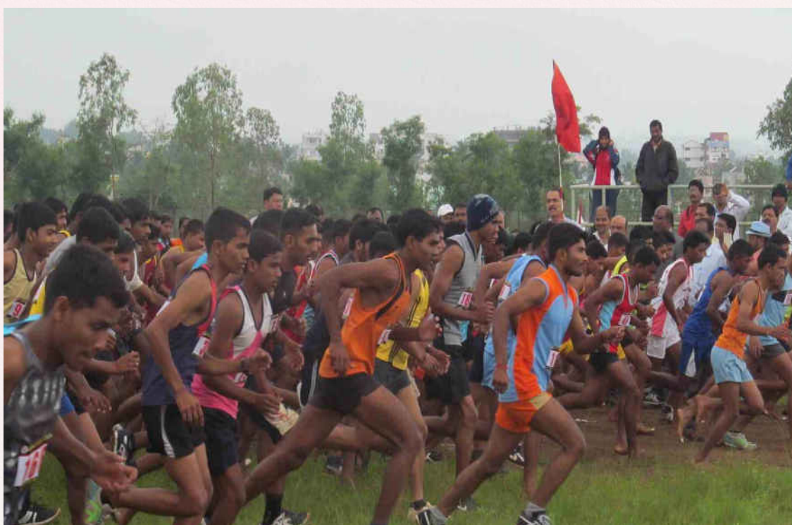
Flag off of the competition