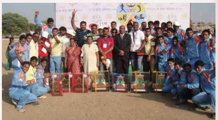
Krida Mahotsav – 2014 held at Nanded Group photo with winning trophies