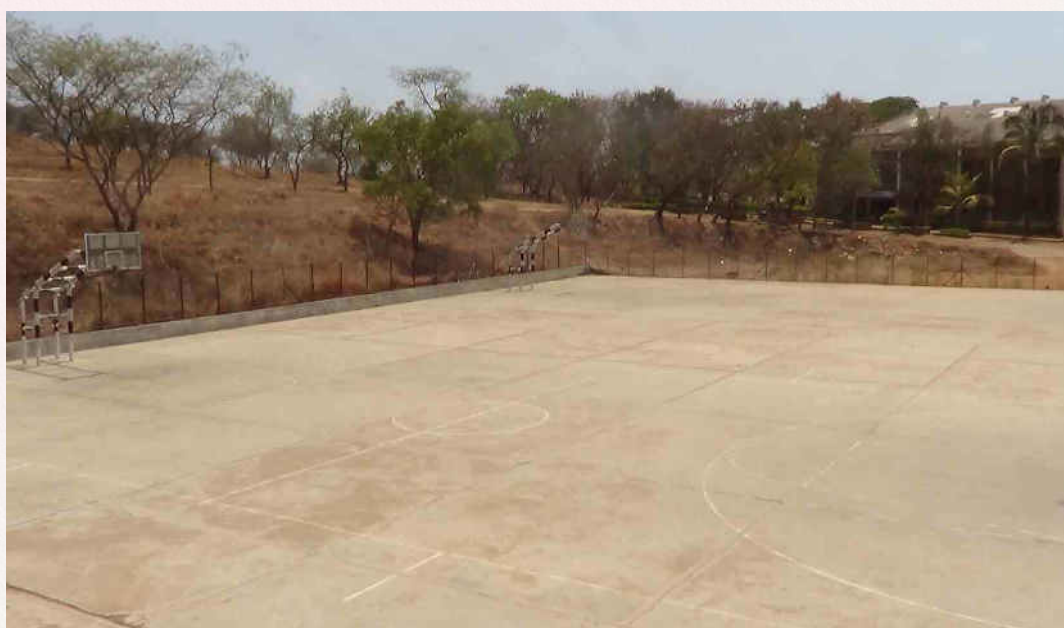
Cemented Basketball Courts