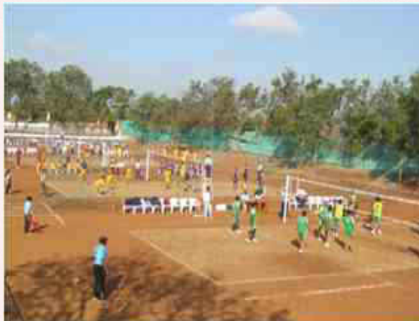
West Zone & Inter Zonal Inter Varsity Volleyball Tournament 2013-14