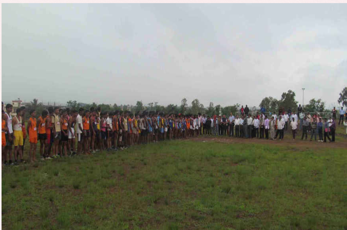
Inter Zonal Cross-Country (Men & Women) Competition