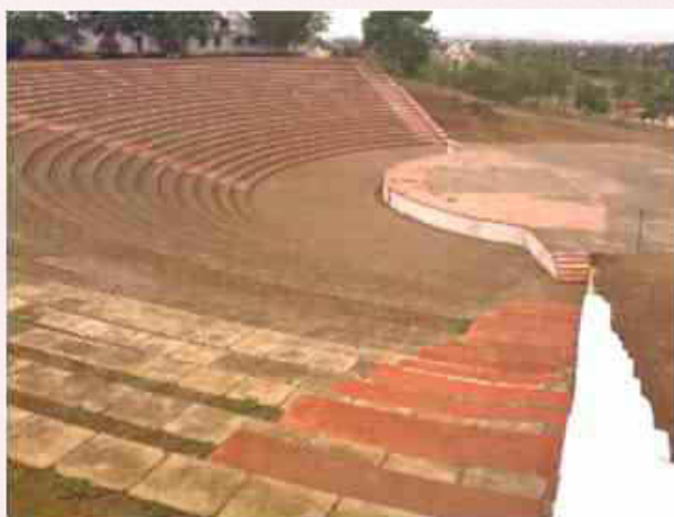
All India Inter Varsity Wrestling Championship 2007-08