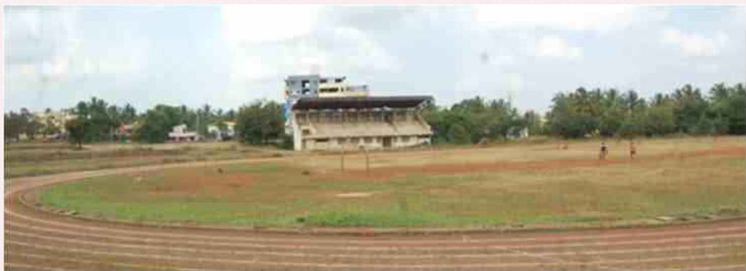
Eight Lane muddy Athletics Track with pavilion