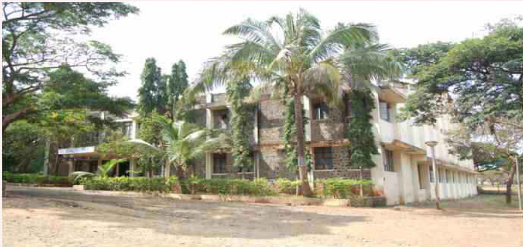
Main Building of Sports Department and Gymnasium