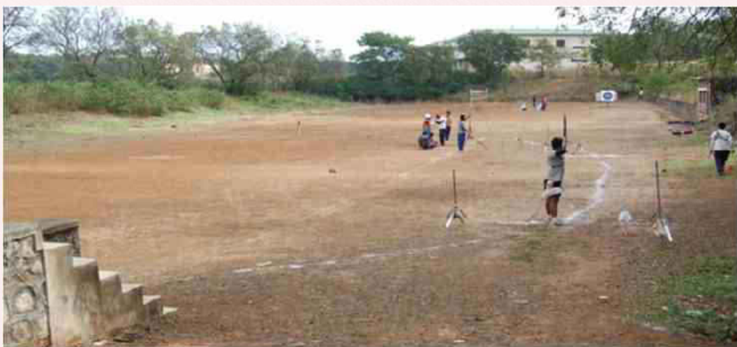
Kho-Kho, Kabaddi Grounds & Archery field