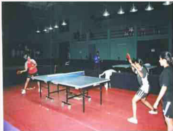
West Zone & Inter Zonal Inter Varsity Table-Tennis Tournament 2006-07