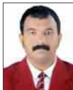
Shri. S. S. Mali Arts & Commerce College, Kasegaon