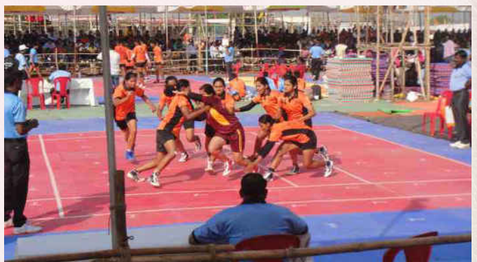
Krida Mahotsav – 2014 held at Nanded Kabaddi Women Team Match Moment