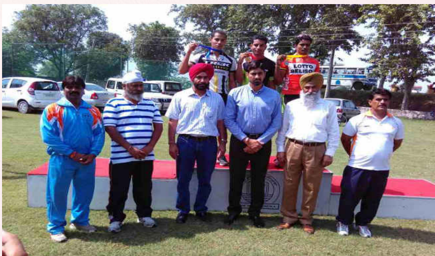
Photograph of the Victory Ceremony of said event with the officers of Patiala University