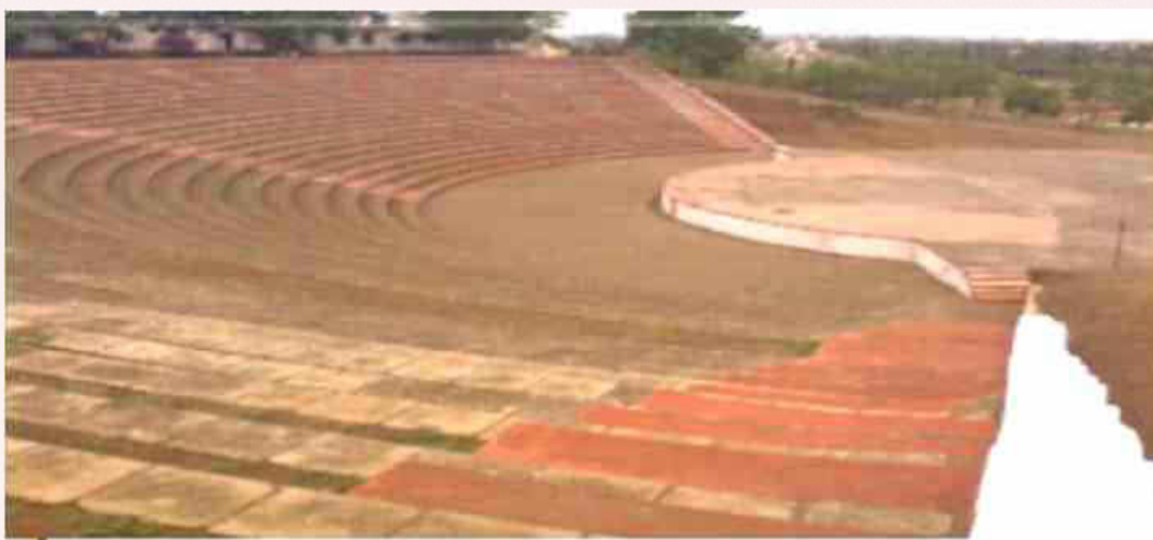
Open Air Theatre for Wrestling & Cultural Events