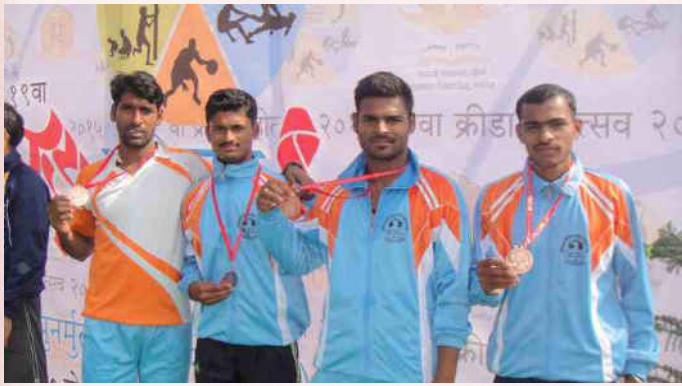
Krida Mahotsav – 2014 held at Nanded 4 x 400 mtr. Relay Men Team – Bronze Medal