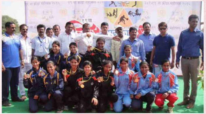
Krida Mahotsav – 2014 held at Nanded 4 x 400 mtr. Relay Women Team – Bronze Medal