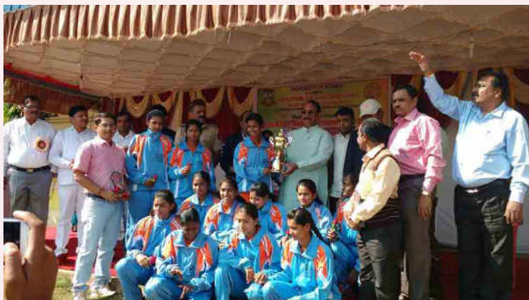
Victory Ceremony at Mumbai with officers of Mumbai University, Mumbai

University Kho-Kho (Women) team secured IIRD place in West Zone Inter University Kho-Kho (Women) Tournament 2015-16 held at University of Mumbai, Mumbai from 22nd to 25th December, 2015 and qualified for All India Inter University Kho-Kho (Women) Tournament 2015-16 held at the Mahatma Gandhi Kashi Vidyapith, Varanasi from 03rd to 06th February, 2016.