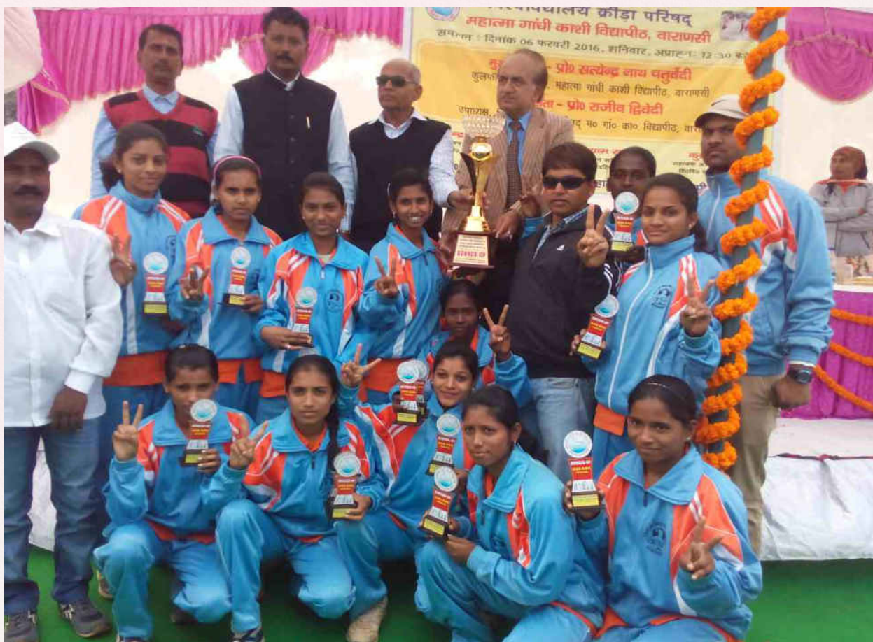
Victory Ceremony at Varanasi