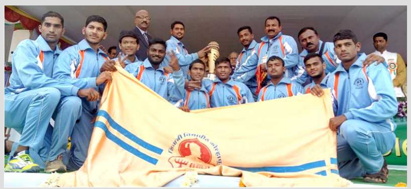
Kabaddi (Men) First Place - Gold Medal