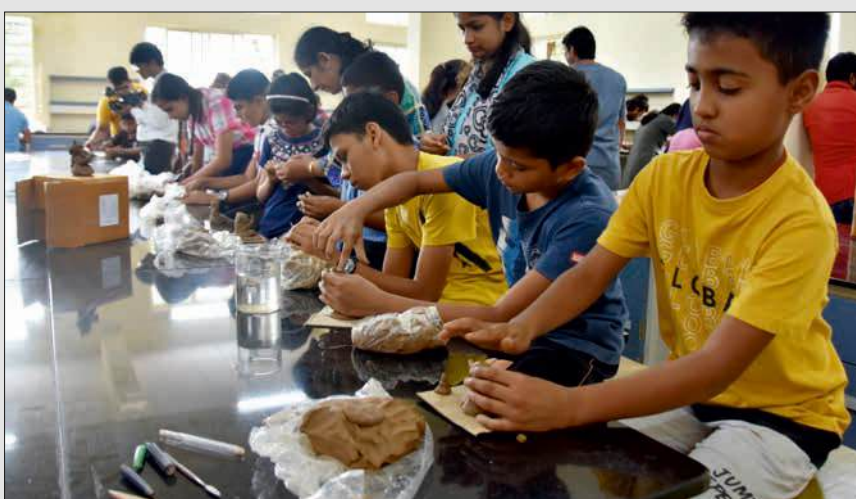
School students participating in an environment-friendly Ganesha idol making workshop organized by the Department of Environment Science, Shivaji University.