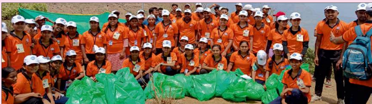
More than 13,000 kg of plastic garbage was collected under the Cleanliness Camp of Raigad fort by the volunteers of National Service Scheme of Shivaji University.