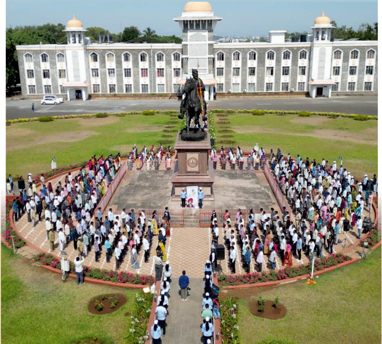
A panoramic view of the felicitation program organized at Shivaji University on the occasion of Lokraja Rajarshi Shahu Maharaj Memorial Centenary Gratitude Festival.

Estd. 1962 A++ Accredited by NAAC (2021) with CGPA 3.52