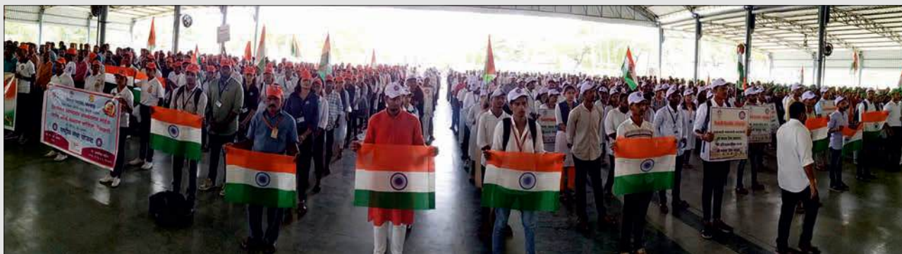
Volunteers of NSS and other students participated in the National Anthem singing during Swarajya Mahotsav in Shivaji University.