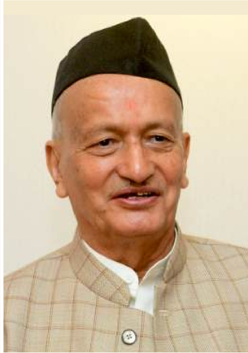
Hon'ble Shri. Bhagat Singh Koshyari Chancellor (Till 17/02/2023)