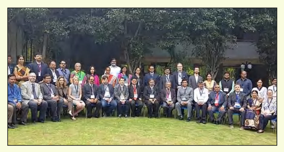
Shivaji University is among eight Indian Universities of India selected to collaborate with the 'European Union'.