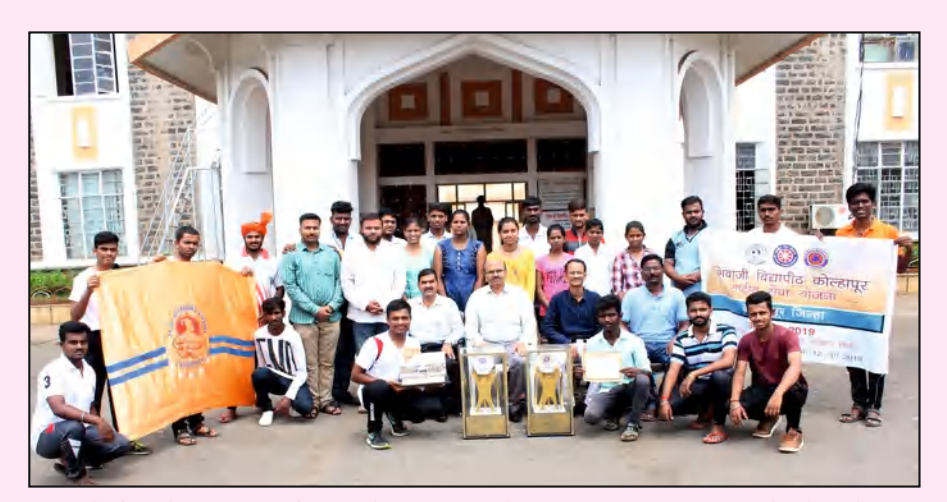
University's 'Awhan 2019' revolving trophy winner team with the dignitaries.