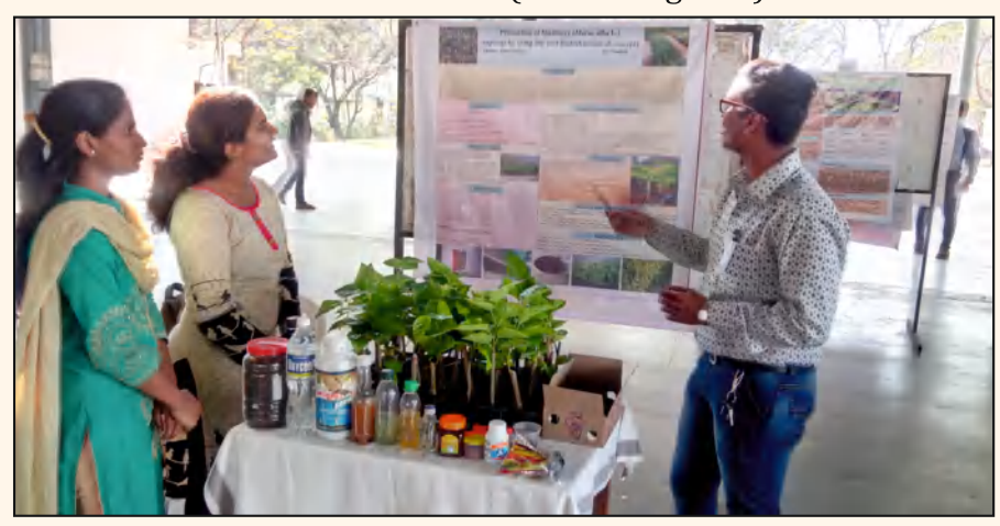
Researcher explaining his research in the festival of 'Avishkar' (Invention)