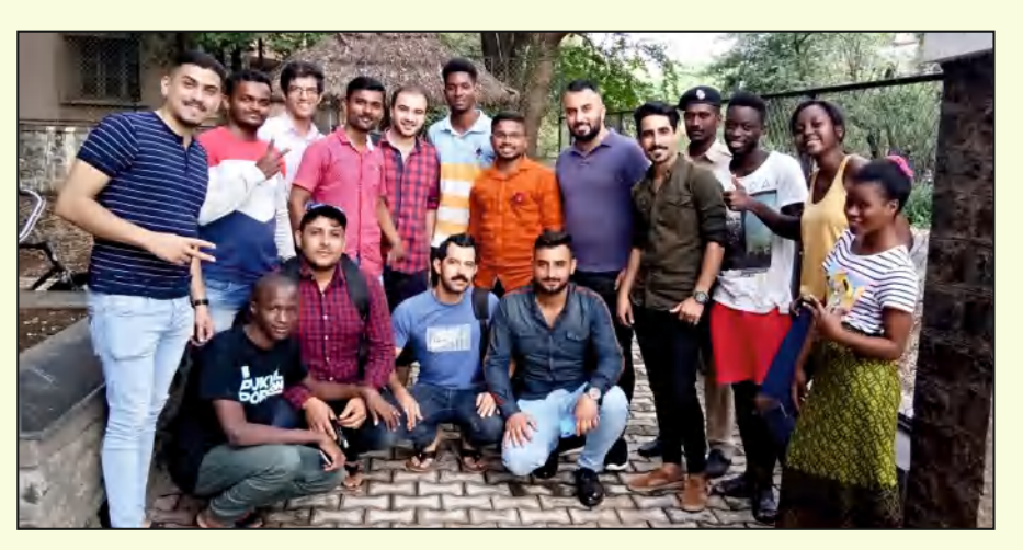
International Students studying at Shivaji University.