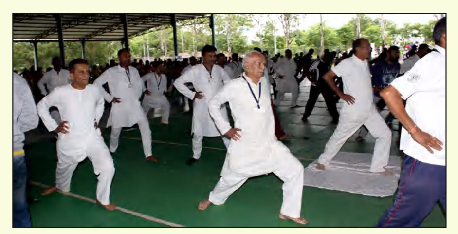
Shivaji University in association with Shri Kshetra Siddhagiri Math (Kaneri) and Daily Maharashtra Times celebrated the 4th International Yoga Day.