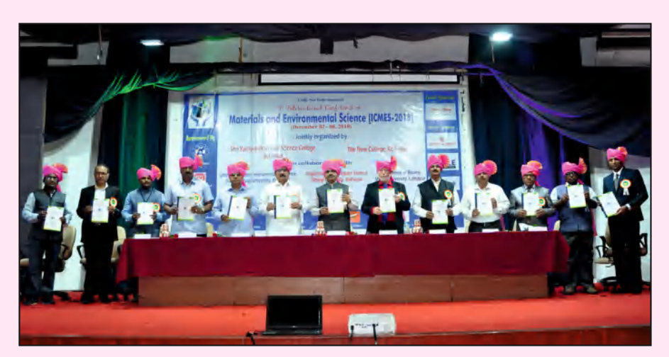
Dignitaries releasing a souvenir at inaugural session of the international conference .