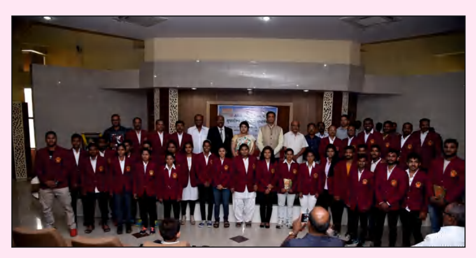
Colours -2018 award winner sports persons of the University .