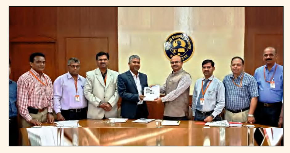
A Memorandum of Understanding (MoU) for student –faculty exchange was signed between Shivaji University and Jehangir Nagar University, Dhaka (Bangladesh)