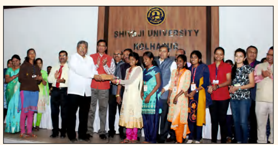
Shri Chandrakant (Dada) Patil, Minister of Revenue, Maharashtra State and Guardian Minister, Kolhapur Dist. distributing the amount the girls for their bus pass.