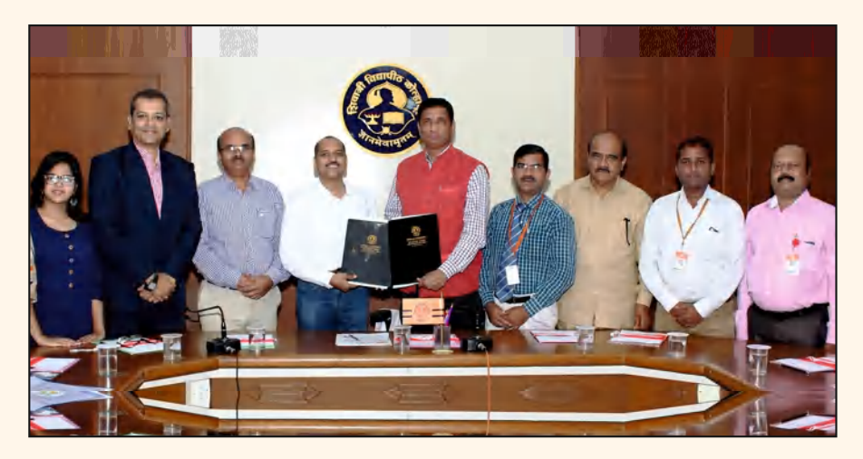
A Memorandum of Understanding (MoU) was signed in between Shivaji University's Samruddhi TBI Foundation ,Department of Technology.