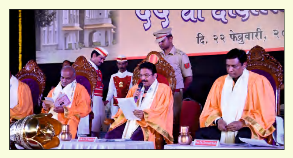
The Hon. Shri Chennamaneni Vidyasagar Rao, Governor, Maharashtra and Chancellor of University chaired the 55<sup>th</sup> Convocation Ceremony.